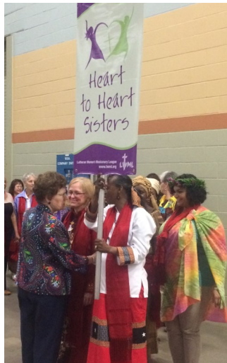
Heart to Heart Sisters getting ready to enter