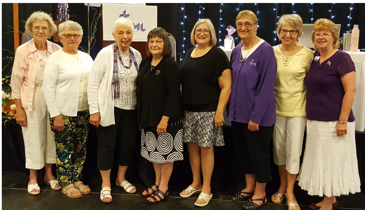
Past District Presidents attending the District Convention:

The 2018 Minot Convention delegates approved many bylaw changes. Most of the changes were simply to bring the North Dakota District LWML bylaws in alignment with National LWML bylaws. There was one change to the ND District LWML bylaws. The new bylaw defines who can be an individual member, how to become an individual member, and what privileges are and aren't available to an individual member. An individual member can express a view, vote, and be elected to an office at the zone level. An individual member cannot serve as a delegate to and cannot vote at either the District or National conventions. This is because an individual member only represents herself, whereas, a member of a society represents a group of members. The individual member can be appointed to a district committee and elected to a district office. As an elected district officer an individual member can vote at the district convention, as she is representing all the members of the ND LWML district who elected her to the office. The District Bylaws should be updated and posted to the website by the end of September.