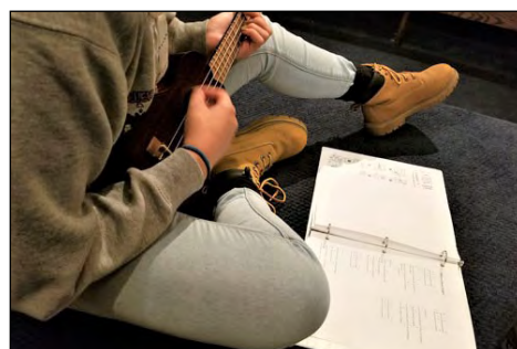
The doors to open a child's heart come in all forms. Music and song, in the hands of a vibrant Deaconess ministry, help kids discover successes they didn't know they could achieve.