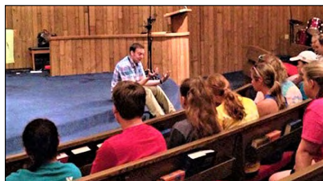
One of the weekly chapel services on the Ranch's Minot Campus. Real ministry happens each week where children learn to see the world differently, feel the love of God through those who care for them, and begin to look to the future with hope.