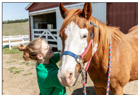
Building Bridges into kid's lives — When kids are traumatized by abuse, neglect, or abandonment, horse therapy at the Dakota Boys and Girls Ranch can help children begin their move toward Christ-centered healing.