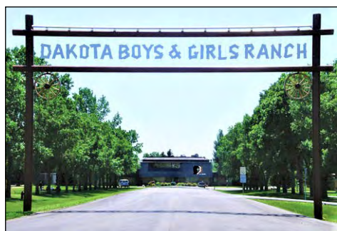
"At the Ranch we help at-risk children and their families succeed in the Name of Christ."

As one approaches the Dakota Boys and Girls Ranch campus in the Minot area, the first impression is one of passing into a beautiful campus of peace and tranquility. For the young residents of this facility, however, their young lives have been anything but peaceful and tranquil as they first arrive there. Most of these youngsters have experienced trauma and abuse almost unimaginable to us. Many of the young girls have suffered abuse at the hands of male figures and find it very difficult to relate to males especially in leadership roles. Deaconesses can and do fill a much needed role in this area especially to these young girls. The Deaconess' are highly trained in areas that will give much needed emotional and especially spiritual support to these girls. Many of whom have never learned of the love Christ has for them. The National LWML delegates overwhelmingly purposed a mission grant of $81,680 to fund the Deaconess program at the Ranch for the next biennium. This will allow many troubled lives to overcome their hardships and come to Christ. His arms are open wide to them as He welcomes them in to His fold of young lambs so needing the Great Shepherd.