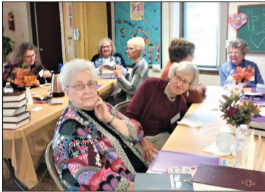
Bible study at NW Zone Fall Rally