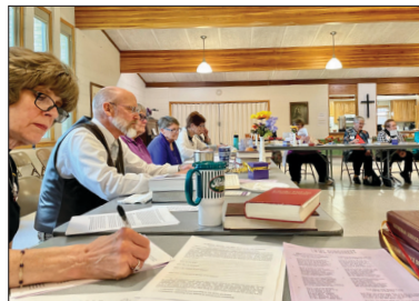
SW Zone Fall Rally Bible study at Redeemer in Dickinson.