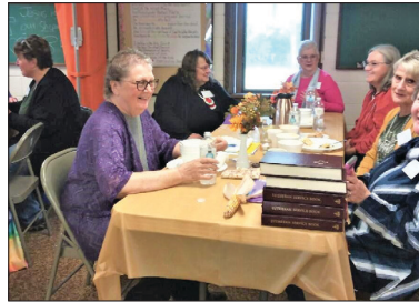
Delicious lunch of various types of soups, salads and desserts were served.