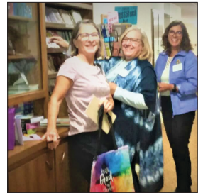
Making time to shop at the Booknook.